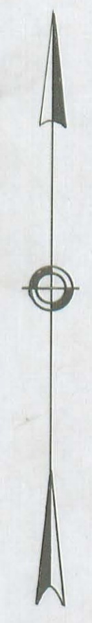
PLAT OF PROPOSED VACATION OF LOTS 173, 191, 192, 193 AND 194 PRATERS ALLOTMENT RUSSELLS POINT, OHIO. SCALE 1 INCH = 40 FEET. OCTOBER, 1932. OFFICE OF COUNTY SANITARY ENGINEER.